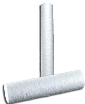
Figure 1: Hytrex Depth Cartridge Filters