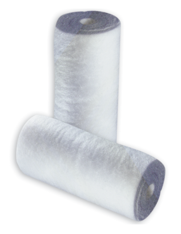
figure 1: Aquatrex filters