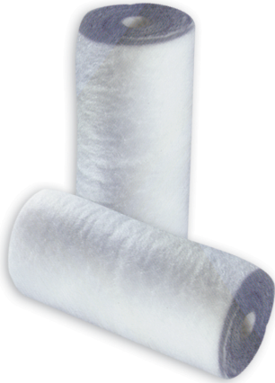
figure 1: Aquatrex filters